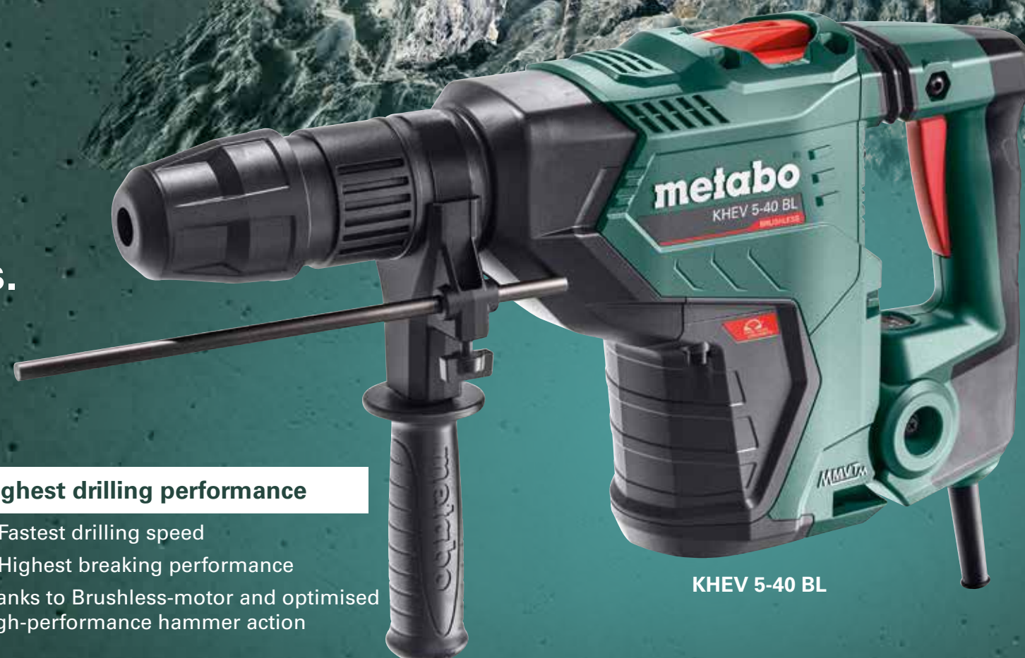
KHEV 5-40 BL