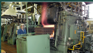
Steel parts with hardening plant

In every Metabo tool there is traditional German engineering ingenuity. Since 1924 we have been developing innovative ideas in our Nürtigen plant and have been implementing them into pioneering tools and perfect accessories for professional users directly on site. Our service, tailor-made to your requirements, also makes us a strong partner for the industrial sector.