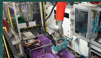
Plastic injection moulding